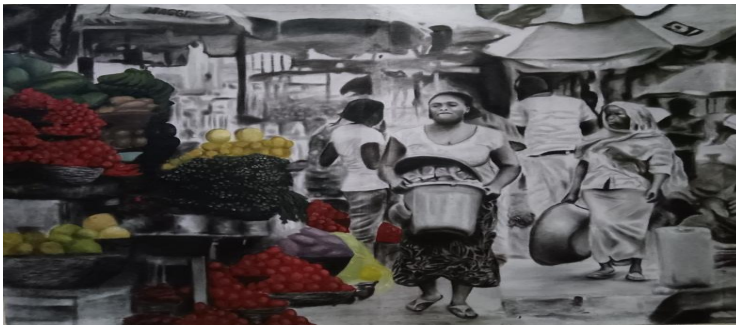
Plate 10 Artist: Chimezuteh Ejikeme-Micah Title: Busy Day Medium: Charcoal and Acrylic on canvas Size: 3 x 4 ft Year: 2022

The artwork titled “Busy Day” was chosen to depict how busy sometimes the Choba market can be. Choba is a blessed community which is visibly seen during Market Days. So many people from all walks of life converge to participate in this event. As a result, there are mixed ethnicity nationality that usual converge in the market. There is no seclusion or discrimination in the manner that one is from a different ethnic group. Traders work together and sell their goods to anyone irrespective of where they come from. Because of this, whatever goods that are not sold predominantly by the indigenes of Choba, others from different parts of the states will definitely have it for sale. So many traders have benefited from this event due to the success it has at each market day.